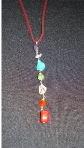
Chakra Necklace OR Earrings